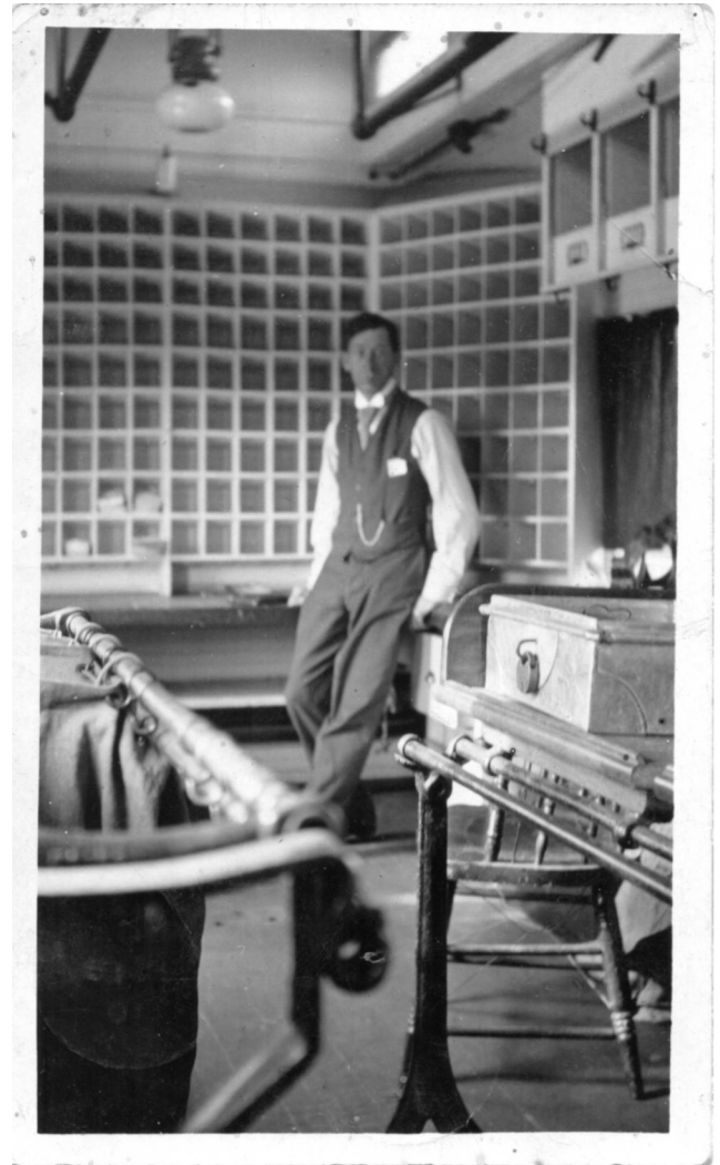
Real Photo Post Card, circa 1905 shows a Canadian railway post office clerk posing in the mail car - note the cramped quarters.

Map above shows the DAR route. Note that the section between Halifax and Windsor was owned by the Intercolonial Railway and used by the DAR through special arrangement.