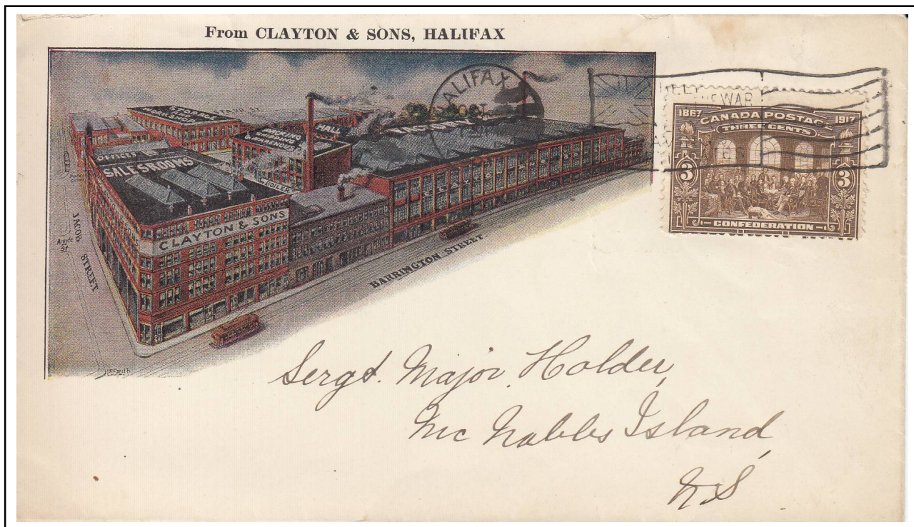
Lithographed - Rare Destination - McNabs Island (Halifax Harbour) 3¢ Confederation Jubilee tied by OCT 3 / 1917 International Postal Supply machine dater and Flag slogan cancel "Help to Win the War / Buy War Savings Certificate" (late usage)