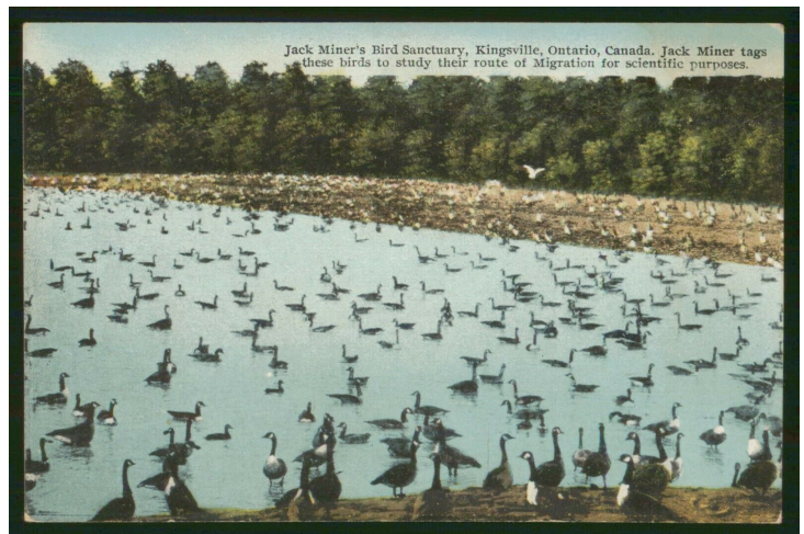
Postcard: Jack Miner's Bird Sanctuary, Kingsville, Ontario...