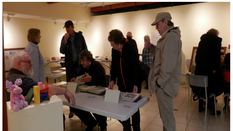
Collectors enjoy a Saturday at the DesBrisay Museum in Bridgewater.