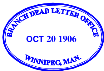
42x28 mm Oval, double frame blue ink

Early Dead Letter Office covers to foreign destinations are not common, especially before rate changes of Oct 1, 1907 set by regulations at the 1906 - 6 th UPU Congress Rome, Italy. This large cover has many interesting characteristics that cannot be found in a smaller envelope.