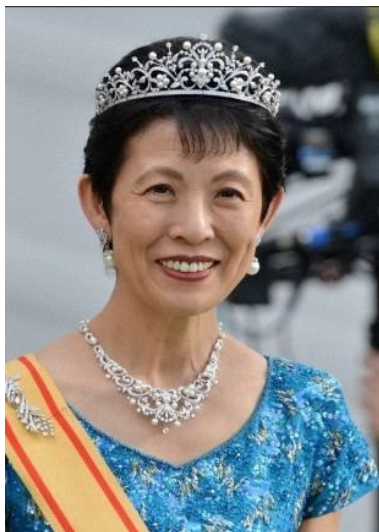
Fig 1 Princess Takamado

**Exhibit title: 'Numbered Scottish Postmarks 1844 - 1901'