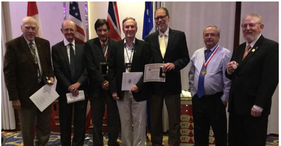
NSSC award winners at BNAPEX 2018 L to R: