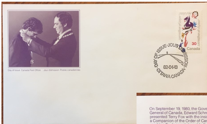
Figure 1a. Front FDC 30c stamp of Terry Fox (Canada #915) cancelled on first day of issue; 13 Apr 1982