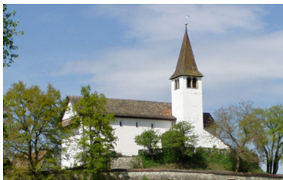
Figure 4: The south side of the church shown in a more recent photo (www.buesingen.de).

Interestingly, if the Post Offices of these two towns were then where they are located now the distance is only 3.43 km.