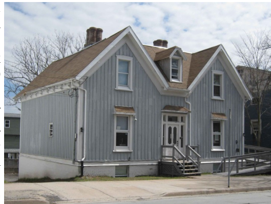
— 2549 Brunswick St, Halifax —

He had many connections with Halifax. He lived here in the 1860s on Brunswick Street (now 2549 Brunswick Street). Sometime after moving to Ottawa in 1869 he purchased Blenheim Lodge (now 1298 Blenheim Terrace) on the Northwest