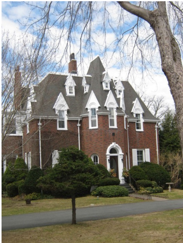
— 1298 Blenheim Terrace —

Many more details about Sir Sandford can be found in the literature and on the web.