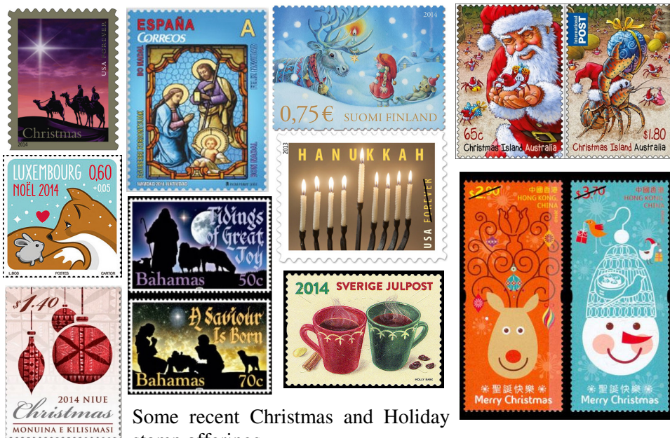
Some recent Christmas and Holiday stamp offerings

Feel free to email me with any questions about Dead Letter Office handstamps, or any material I may have an interest in at gwsteele57@gmail.com .