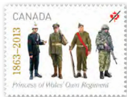
New issue: April 9 2013 Princess of Wales Own Regiment