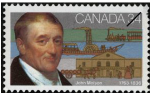
1986 Scott #1117

Grand Master of the Provincial Grand Lodge of Montreal.