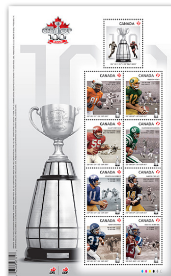
1912-2012 Grey Cup Souvenir Sheet

Prior to the opening of the games on 27 July, the torch had been carried on a 70 day tour of the United Kingdom. The Post Office marked the stops on the journey with special cancellations on commemorative covers. On day 5 it traveled from Bath/Bristol to Cheltenham. The cover shown is the Cheltenham cover and depicts a steeplechase at the famous Cheltenham racecourse. The cover has an Olympic 1 st class stamp, showing the London 2012 logo. The torch was carried around the racecourse by Zara Philips, the Queen's granddaughter. Zara went on to win a silver medal as part of the British team in the equestrian events.