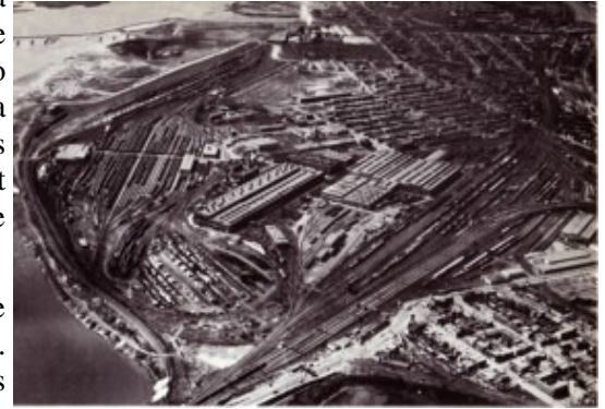
Point St. Charles CN Yards ca 1950s

When I was a young boy I went exploring in my grandfather's garage attic. We lived in Montreal in Rosemount, and my grandfather lived all the way across town in Point Saint Charles. He lived in a working class neighbourhood near the CN Railway repair shops, and a visit to him was an adventure, having to take a long and exciting bus ride across Montreal, with two transfers and a wait somewhere downtown because the buses never ran according to schedule.