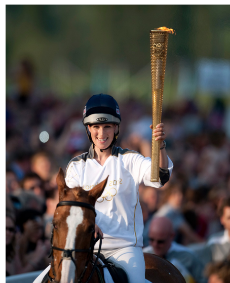
British Olympic torch-bearer Zara Philips