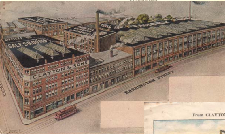
Fig 3 (top) 1906 cover showing colour picture of plant