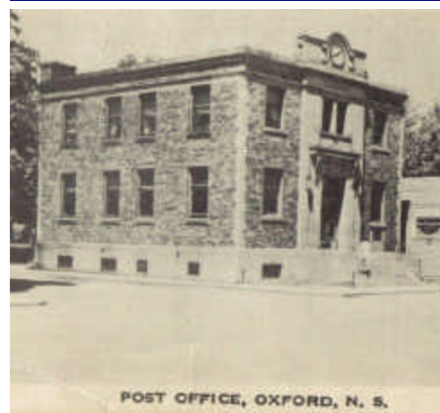
POST OFFICE - Oxford, NS 1940s