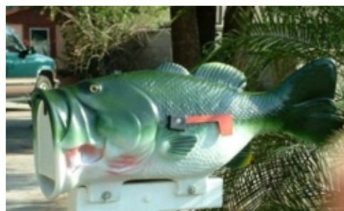
Quite a catch — A large-mouth mailbox!!