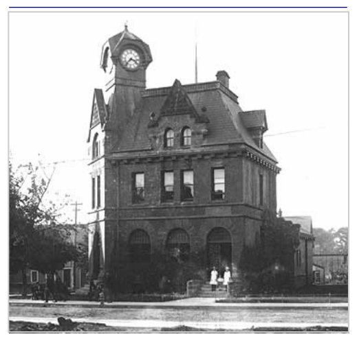
Liverpool Post Office circa 1920