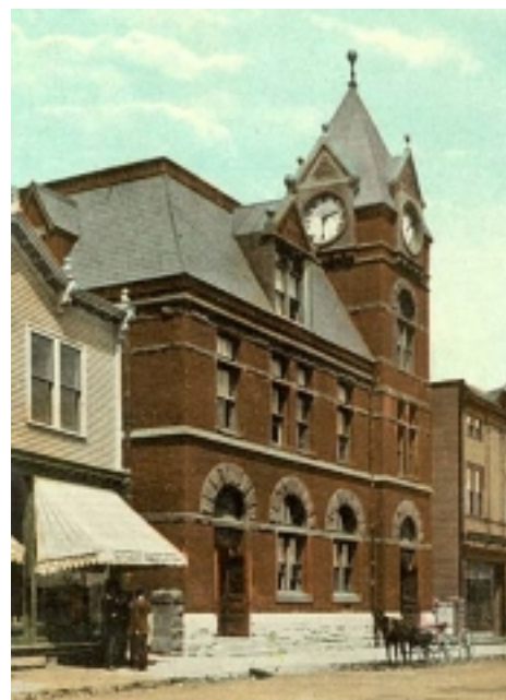
Digby, Nova Scotia Post Office ca. 1910

For the third time in as many years Canada Post has announced a domestic letter (30 g) rate increase of 1 cent to 51 cents effective January 16, 2006. US and International rates will also rise by 4 cents to 89 cents and $1.49 respectively. Under the price cap formula approved by the federal government in 2000, a rise in domestic rates cannot exceed 66.67 % of inflation as measured by the Consumer Price Index from May prior to the previous rate change to May of the current year (1.6% 2004-05; 2.5 % 2003-04). Canada Post also cites the use of the unused portion of the previous allowed change in calculating the current rate increase and has used this formula in the last three changes.