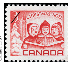
Early Canadian Christmas Stamps.