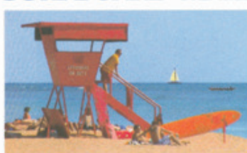
A lifeguard tower on Waikiki Beach.

As part of the ceremonies for the release of stamps depicting surfing on August 24 2002, a surfer was commissioned by Hawai'i Post to paddle his surfboard from the Hilton Hawaiian Village on Waikiki Beach to the Outrigger Hotel, further down the beach. On his surfboard, the surfer was carrying with him many covers that were cancelled that day with a special postmark showing that they were "Surfboard Mail".