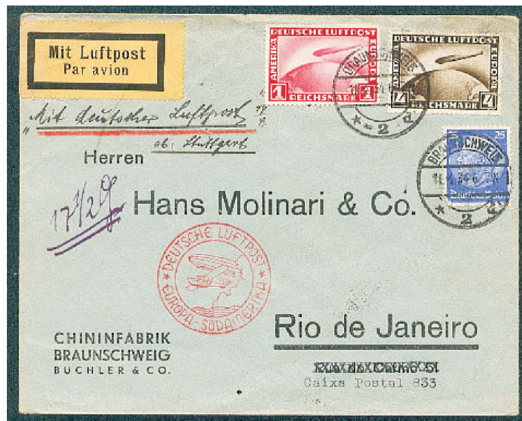
1934 Airmail with 1 and 2 Mark stamps of the Zeppelin and a 25pf definitive. The cachet has 2 "Braunschweig - 2" postmarks and a red "Deutsche Luftpost - Europa - Sudamerika" mark. An interesting cover from a recent auction offering.