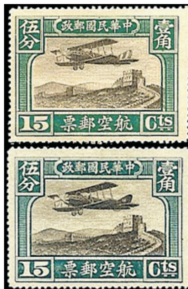
China's first airmail stamps. The top stamp was issued in 1921 and shows the Republic emblem on the tail. The 1929 stamp on the bottom shows the Nationalist emblem instead.

Stamp collectors were thrown into great confusion in those years of turmoil. A notion was abroad that "stamp collecting is something bourgeois". Those who collect stamps were considered questionable guys. As a result stamp collectors dared not talk about stamps for fear people might spot them. That was how stamp collectors felt about it at the time. That is why I committed all my collections to the flames for which I held taken decades of pain.