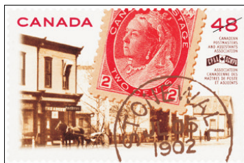
Canadian Postmasters and Assistants Association, 1902-2002 July 5

World Youth Day Self Adhesive Booklet of 8 July 23