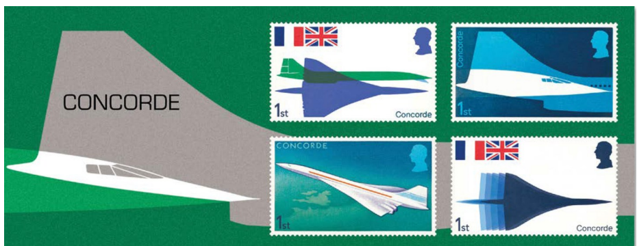
Fig. 3: Concorde 50 th Anniversary of service

France issued a stamp to mark 50 th anniversary of the first flight in 2016.