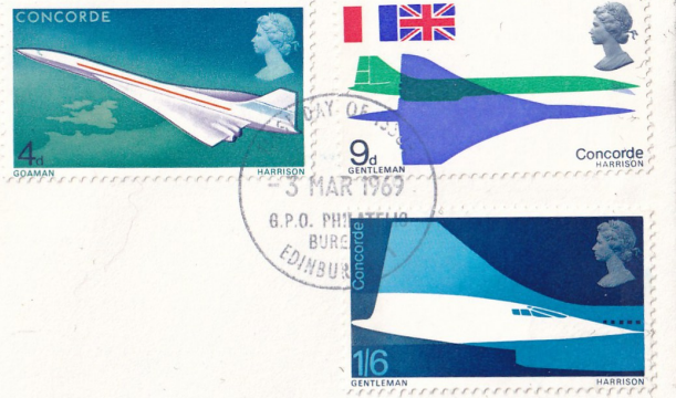
Fig 1: Concorde 1969 Royal Mail

The first commercial flights were flown on 21 January 1976. The flights departed simultaneously at 11.40 a.m. from London's Heathrow airport and Paris' Charles de Gaulle airports. As supersonic flights in American air space were first approved on 4 February 1976, British Airways initial destination was Bahrain and Air France's flight went to Rio de Janeiro.