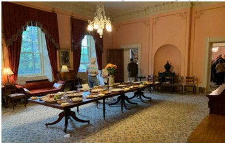
Dining Room