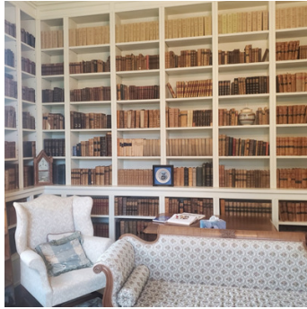
Library