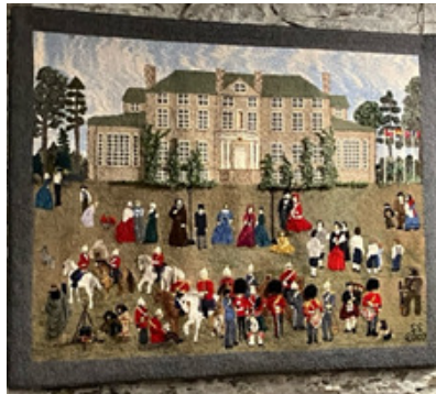
Hooked rug featuring Government House — artist unknown

Moncton and works in graphic design. She has designed three stamp issues for Canada Post – the 2023 Holiday Winter Scenes; the 2024 Endangered Frog stamps and the