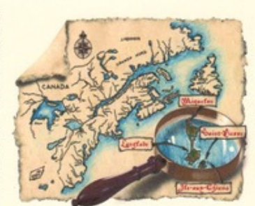
Archipel de Saint-Pierre-et-Miquelon

Parmi ces surcharges, celle avec les caractères "S P M gothiques" associée à trois valeurs 05, 10, 15, et réalisée pour la première fois en août 1885, demeure une frappe très appréciée des collectionneurs. Elle recouvre uniquement un timbre au type "Sage", le 40c. rouge-orange. Ce timbre non dentelé des colonies générales, peu utilisé, était arrivé sur l'archipel en 1877.