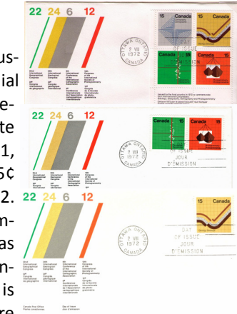
Fig. 4 CP Official FDCs

stamps have a fairly short shelf life, so usage is hard to come by. The Centennial Issue definitive - 15¢ Bylot Island was released Feb. 1967, although the 15¢ rate did not come into effect until 1 Jul. 1971, and the Landscape definitive (15¢ Mountain sheep) was issued 8 Sep. 1972. The 15¢ Radio Canada (Jun. 1971) commemorative preceded and the Christmas issue (1 Nov. 1972) followed, so the window of use for the Earth Sciences issue is only 3 months. A couple of examples are shown right (Fig. 5).