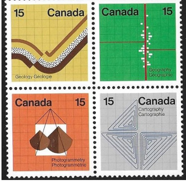
Fig. 1 Earth Sciences - Scott 582-5

Four stamps, each representing one of the Congresses, were released in panes of 16 stamps representing 4 x 4 se-tenant stamps designed by Fritz Gottschalk. Sheets of 128 images (16 x 8 panes) were lithograph