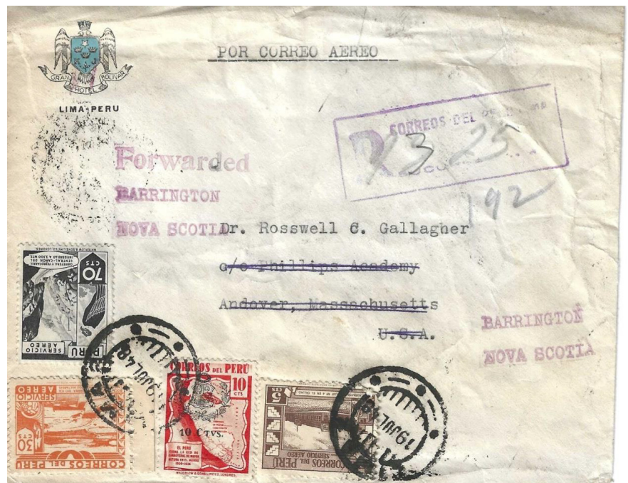
Front of cover. Notice the forwarding directions.

The subject registered mail was sent from Lima, Peru on July 19, 1948 on Gran Hotel Bolivar stationery. The postage of 1 sol, 15 centavos correctly paid for a base rate of 15 centavos, 20 centavos for registration, and 80 centavos for air mail. The dates for