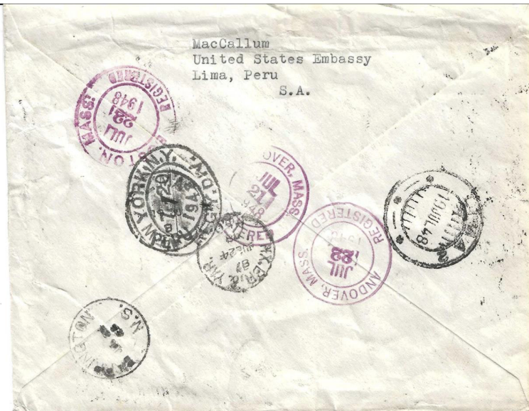
Back of cover showing the many backstamps.