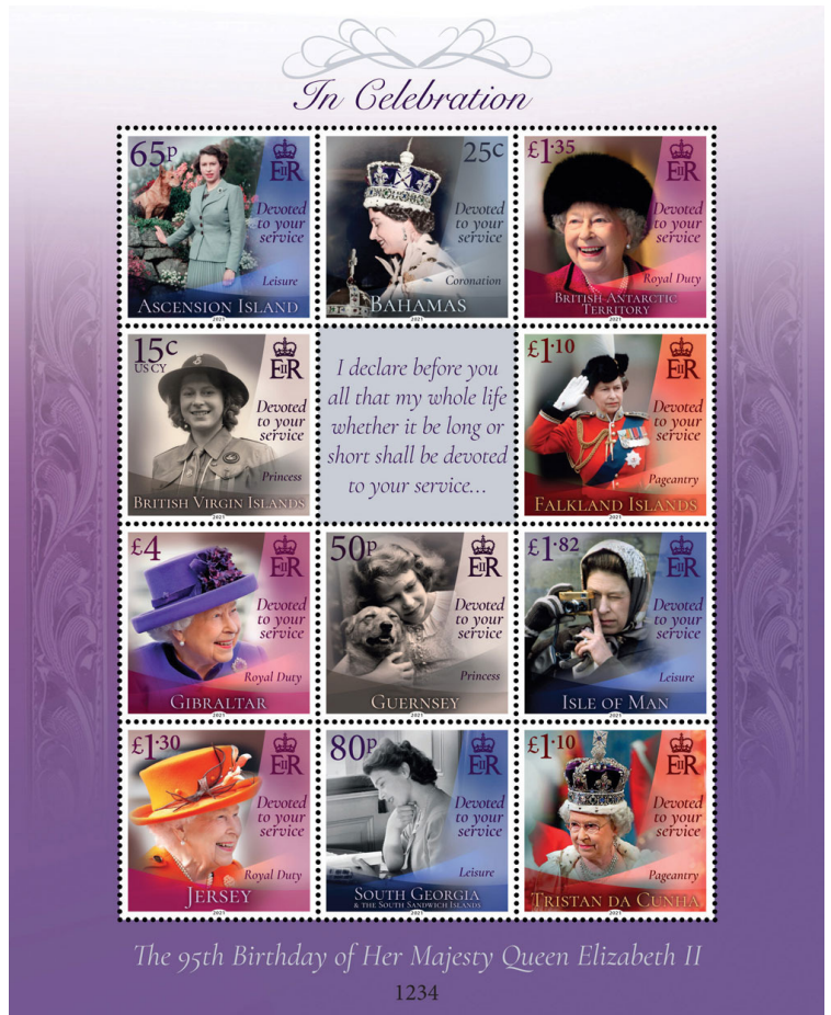
The 95th Birthday of Her Majesty Queen Elizabeth II

Each of the Crown Dependencies and overseas territories produced commemorative stamps bearing the same titles, Princess, Coronation, Marriage, Leisure, Pageantry and Royal Duty. Each stamp shows a different image of Her Majesty on these themes.