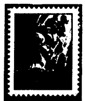
OCT. 8, 1969. CHRISTMAS Perf. 12