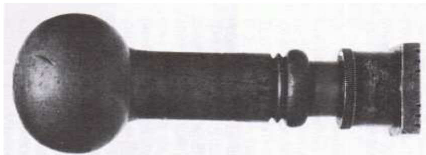
*Diagram and Picture from “The Squared Circle Postmarks of Canada” – Moffett and Hansen 1981.

The Squared Circle hammers were in popular use during the Victorian period, though a few towns continued to use the devices through the Edwardian, and George V periods with the odd straggling use showing up into the late 40”s and even a few in the 50”s.