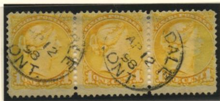
April 12, 1898