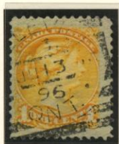
June 13, 1896