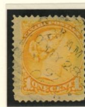
May 28, 1897